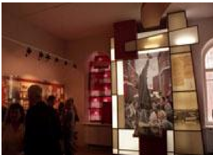
Музей Первого Совета