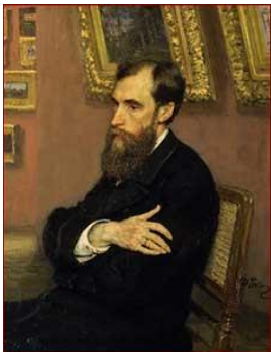
I.E.Repin Portrait of P.M.Tretyakov. 1883 Oil on canvas

The State Tretyakov Gallery is the national treasury of Russian fine art and one of the greatest museums in the world. It is located in one of the oldest districts of Moscow – Zamoskvorechye, not far from the Kremlin.